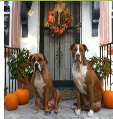
Charolette & Dexter

To donate please visit the Out of the Pits website at http://www.outofthepits.org/Donate.html or e-mail donations@outofthepits.org . We're also on facebook – check us out there!